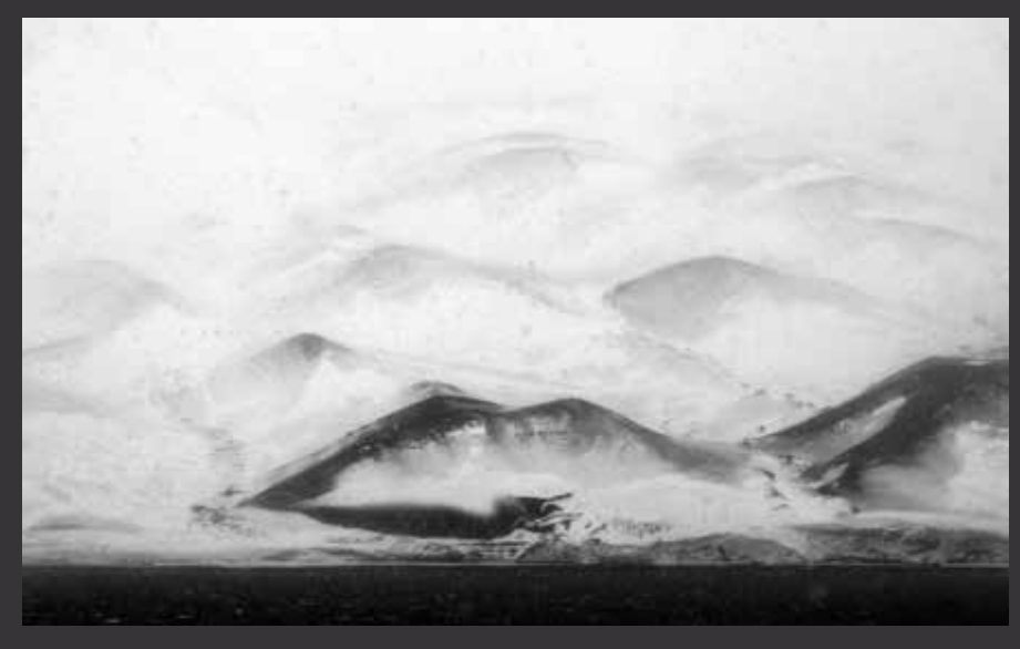
Caldera, Deception Island, Antarctica