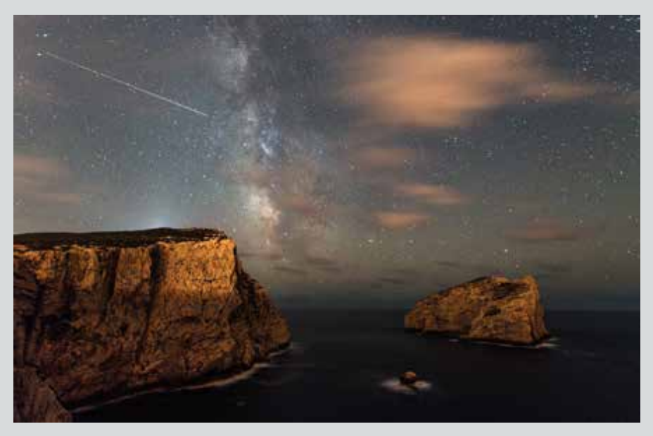
Capocaccia cape and milky way, Sardinia