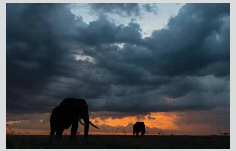
Elephant bulls, Masai Mara, Kenya

Startrails altiplano near Dali's desert Bolivia Left: White-tailed Eagle, Vesteraler Norway